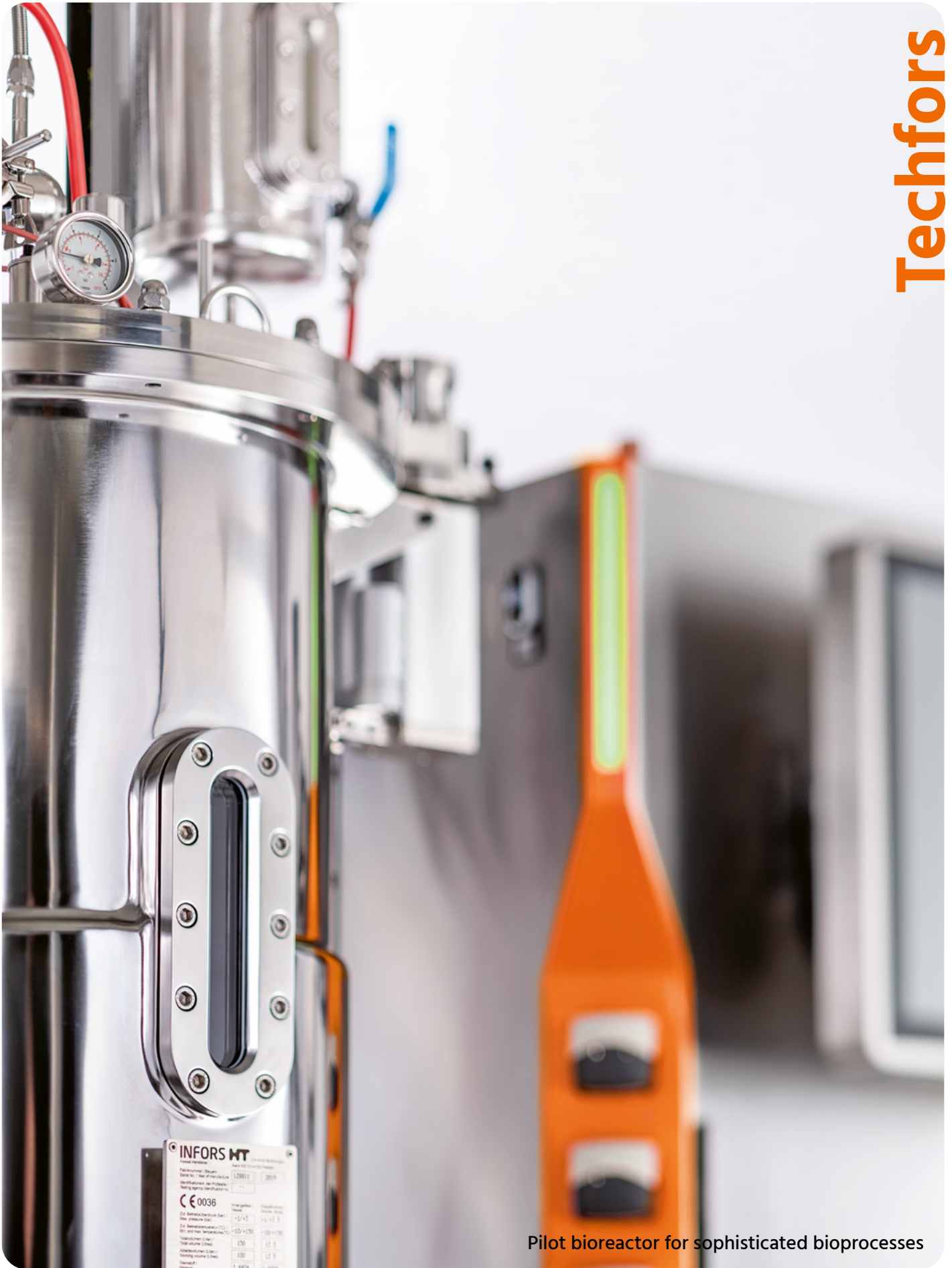
Pilot bioreactor for sophisticated bioprocesses